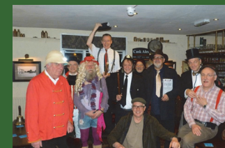
< 2017 Plough Play