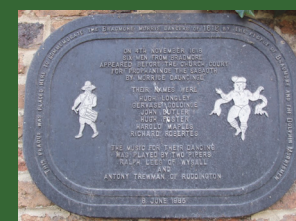
^ 1985 The "Bradmore Gate" is unveiled