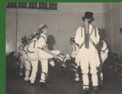
< 1968 Early performance at an NTMC ceilidh