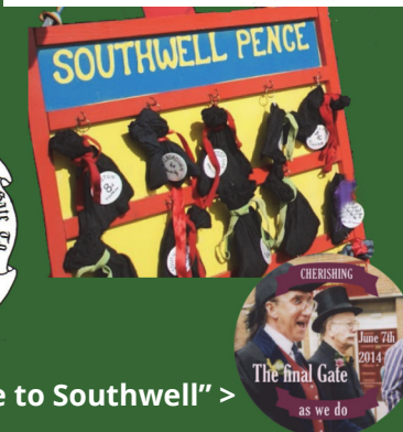
2014 The final "Gate to Southwell" >